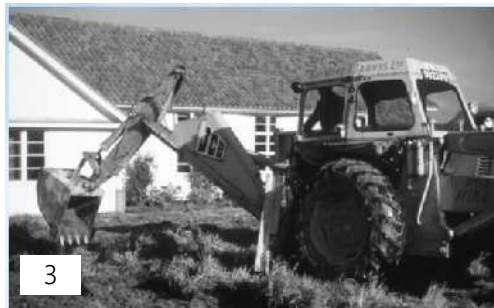
4. Portal Frames December 1960

See and read more about our history on our website https://gurc.net under 'Archives'