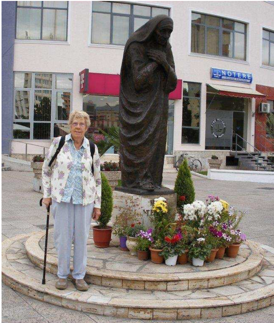
This photo is nothing to do with my article about the Bible Society on page 11, but it shows the statue in Tirana, capital of Albania is of Mother Theresa, who was born in Albania.

region of a dozen or so members and we are planning to reconvene our September meetings (2nd and 4th Tuesdays at 2.15 p.m.) back in the Cornwall Room at our Church. These first two gatherings will be on an informal basis, with lots of chatter and exchange of news and views, plus the collection of our annual subscriptions as per usual that month.