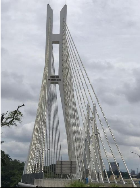
The riverside bridge – Brazzaville's distinctive landmark

Please do not post this on a web page without our permission.